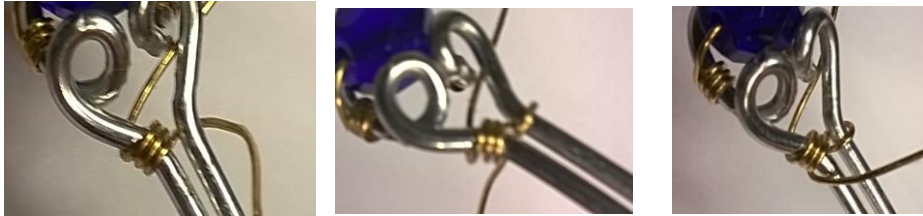
Figure 8 weave is used on many projects. You begin by anchoring your wire to the frame with 3 wraps. On your 3 rd wrap, bring your wire through the center of both wires and then under and around and over the top of the next wire. Bring it between the frame wires again, and back under wire #1, over the top and through the middle again.

Wrap a figure 8 pattern to the length you desire. The one in the tutorial is a size 7.